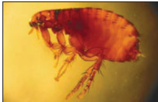
Cat fleas are the most common fleas on dogs and cats. They also infest raccoons, opossums and coyotes.

Cat fleas do not normally live on humans, but do bite people who handle infested animals. Flea bites