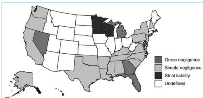
Figure 2. Map of prescribed fire liability standard in each state. Medium gray states prescribe a gross negligence standard, light gray states prescribe simple negligence for burners, dark gray state have case law or statutory language supporting strict liability for escaped prescribed fires, and white states have a liability standard that is undefined statutorily and usually follow simple negligence rules as established by case law.

So what options exist to combat the problems that fire suppression has created? Prescribed burning can mimic historical fire regimes under specific circumstances. It is a cost-effective tool for managing and restoring ranges and forests. Prescribed burning can manage vegetation using a natural process that is integral to native plant communities. Unfortunately, the liability and risks associated with the practice keep prescribed burning from being used extensively. For many landowners, potential lawsuit and litigation costs are important considerations when deciding whether to use fire as an ecosystem management tool.