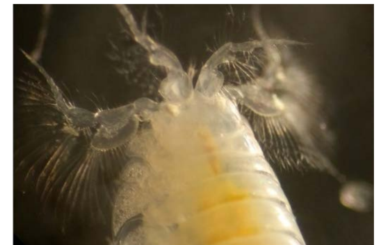
Top: A ghost crab burrow at Port Aransas, TX. Middle: Lateral view of an undescribed haustoriid amphipod from Jamaica Beach, TX. Bottom: Dorsal view of the rostrum, antennae, and eyes of a haustoriid collected at Padre Island National Seashore. The yellowish coloration behind the head is the sand that fills its digestive tract.