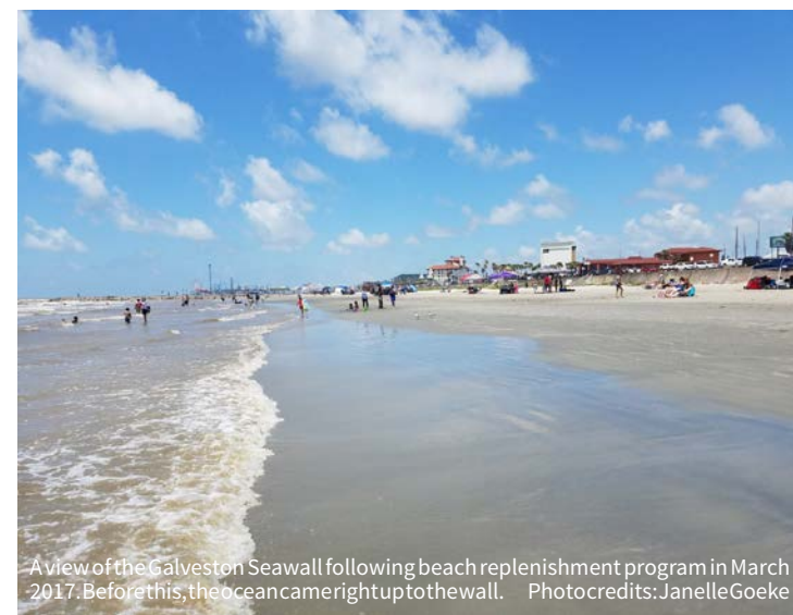
A view of the Galveston Seawall following beach replenishment program in March 2017. Before this, the ocean came right up to the wall.

In Galveston, Texas, the occasional surfer can be seen attempting to ride the waves... and ending belly-flat on the board.