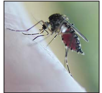
Aedes taeniorhynchus or the black salt marsh mosquito

The aftermath of hurricane Dolly has set up south Texas as a potential hot bed for mosquito production and the diseases they transmit. The mosquito problem is divided up into two distinct waves of activity that occur after a flooding event. The initial influx or first wave of mosquitoes belong to a group known as flood water mosquitoes which include the salt marsh ( Aedes taeniorhynchus , Aedes sollicitans ) and pastureland mosquitoes ( Psorophora columbiae , Psorophora cyanescens , Aedes vexans ). These mosquito species deposit their eggs on soil and in depressions that are subject to periodic flooding. When flooded, the eggs hatch simultaneously resulting in large swarms of mosquitoes five to seven days after the flooding event during the warmest times of the year. These mosquitoes are primarily annoyance species that play minor roles in disease transmission.