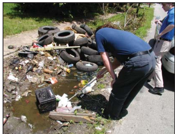
Mosquito control personnel checking a typical Culex quinquefasciatus larval habitat.