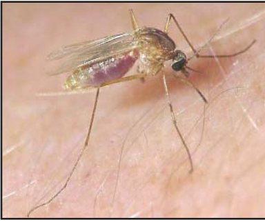
Culex quinquefasciatus or the southern house mosquito

The most important standing water mosquito species is the southern house mosquito ( Culex quinquefasciatus ), the primary vector of West Nile virus and St. Louis encephalitis in Texas. This mosquito species breeds in septic water found in roadside ditches, storm sewers, birdbaths, or any container or depression that holds water for more than seven days.