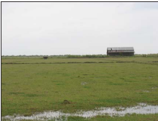
Flooded pastureland is a typical oviposition and larval habitat of flood water mosquito species.

Further information on this disease and fact sheets on mosquito biology and ecology can be found on the Agricultural and Environmental Safety website ( www-aes.tamu.edu ) or from m-johnsen@tamu.edu .