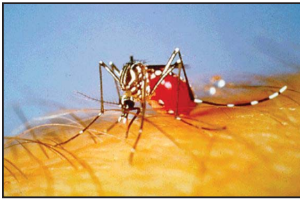
Aedes aegypti or the yellow fever mosquito

The two most common backyard biters in south Texas are also included in the flood water group of mosquitoes and play a significant role in disease transmission. Aedes aegypti (yellow fever mosquito) and Aedes albopictus (Asian tiger mosquito) are black and white in coloration, oviposit (lay) their eggs in artificial containers (cans, children's toys, tires, potted plants, or any object that holds water for over 7 days), and prefer to