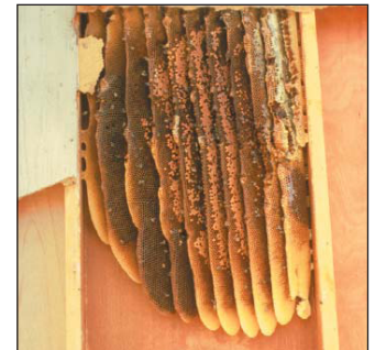
Bees can construct large wax nests rapidly once they enter a home. For this reason, both bees and nests should be removed as soon as possible.

Social wasps are quick to sting when defending their nests. Their attacks can be severe because they cooperate to defend the nest and because individual wasps can sting repeatedly. Honey bees can sting only once. Texas Cooperative Extension publication L-1828, Paper Wasps, Yellowjackets and Solitary Wasps , provides more information on wasps.