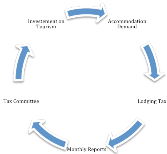
Figure 1. City tax cycle of development