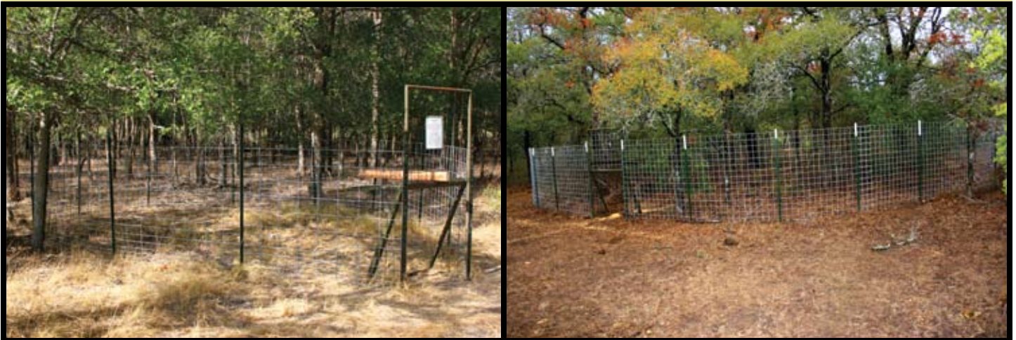
Figure 7. Corral traps of different sizes secured with T-posts. Notice both traps are located in wooded areas, providing both concealment and shade.

Once the trap is in the desired shape and location, use T-posts to anchor the trap (Fig. 7). T-posts should be spaced approximately 4' apart. Feral hogs are extremely strong and will test the trap when captured. Do not assume that the trap can be overbuilt. A captured hog can do serious damage to even the sturdiest of traps, and those made of weaker materials may allow hogs to escape altogether. Always make traps as strong as possible.