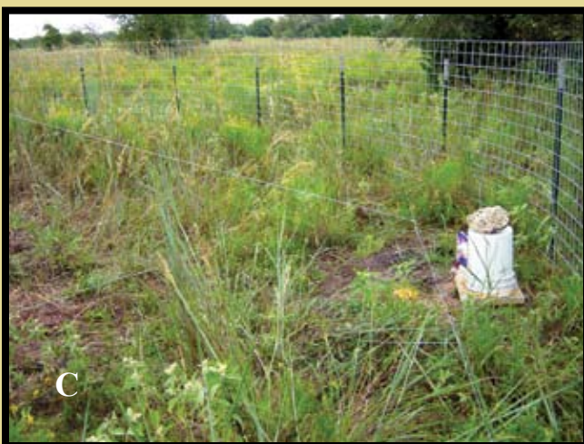
Figure 9. A board is used as a prop on a saloon type door (A). T-posts guide the wire from the prop to the back of the trap (B). The wire is then attached to another wire at the trigger (C). As hogs feed on the bait, the wire is stretched, and the prop pulls from the door.