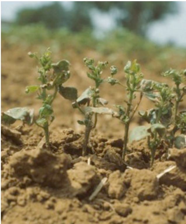
Thrips damaged plants

If you have decided that a preventive thrips treatment is a good option for you, there are a number of preventive thrips treatments to choose from including seed treatments and in-furrow insecticides.