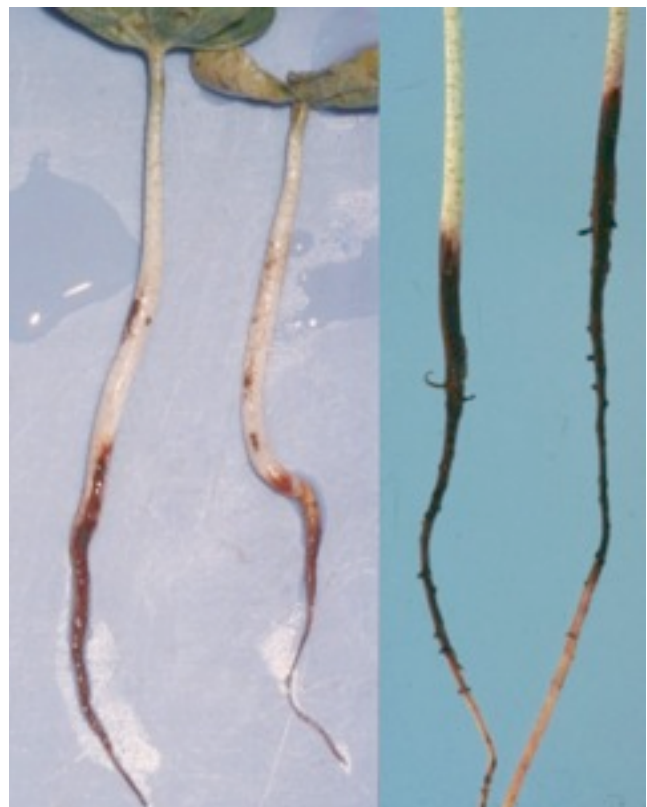
Seedling disease often appear similar, but can be distinguished

Several pathogens, including Rhizoctonia solani , Thielaviopsis basicola , and Pythium spp. are capable of causing seedling diseases of cotton. In West Texas, losses associated with seedling diseases are generally low (<5%); however, increased losses may be experienced conducive environmental conditions. Although it is difficult to distinguish seedling disease pathogens from one another in the field, subtle differences in symptoms and environmental conditions can be used in diagnosis. For example, Rhizoctonia solani typically kills seedlings after they emerge.