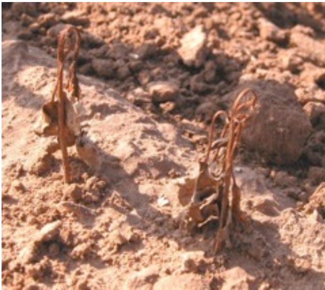
Rhizoctonia solani usually kills seedlings after they emerge

Sunken, black lesions which girdle the stem are visible at the soil line. Infections can occur over a wide range of soil conditions; however, cool wet conditions are most conducive for disease development. Pythium spp. can attack the seed, radical, or stem resulting in a seed rot, pre-emergence damping off, and post-emergence damping off, respectively. Plants infected with Pythium spp. may have more of a water-soaked appearance. Pythium spp. are more severe in areas with poor drainage and the soil has remained saturated for several days. Thielaviopsis basicola infections occur on portions of the stem (hypocotyl) below the soil surface and on roots, resulting in a blackened root system (which gives rise to the common name of the disease Black root rot). This disease is most commonly found in heavier soils and may be more severe in the presence of the root-knot nematode. Black root rot development is most severe under cool, wet conditions. Fungicide seed treatments are effective at minimizing losses associated with these diseases, and aiding in initial stand establishment. All commercially available cotton varieties contain a standard or base fungicide treatment. Ideally these treatments are comprised of fungicides with activity against the aforementioned pathogens. The most common fungicide seed treatments and their spectrum of activity are listed in Table 1 .