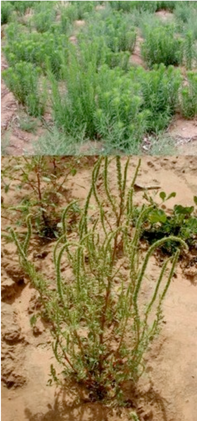
Marestail (top) and Palmer amaranth have developed resistance to Roundup in other portions of the cotton belt

amaranth (carelessweed). To date, there are 15 different weeds worldwide that have been confirmed to be resistant to Roundup . One of the main reasons for the selection of herbicide-resistant weeds is the sole reliance on a single herbicide to control weeds over the course of several years.