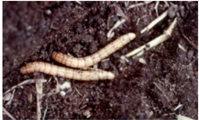
Large false wireworm larvae

Coming into this season there maybe concern regarding the potential for wireworm problems when planting into fields with high residues of wheat, corn and primarily sorghum. Wireworms have been occasionally troublesome in cotton north of Lubbock where more grain crops are produced.