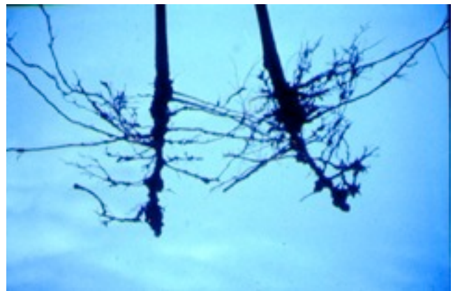
Cotton roots heavily infested with root-knot nematodes

Several species of nematodes are capable of infecting cotton roots. For our region, the root-knot nematode ( Meloidogyne incognita ) is the most prevalent. Symptoms associated with root-knot damage include stunting, poor vigor, yellowing of leaves, and wilting, which may be confused with a nutrient disorder or deficiency. One characteristic that can be used to identify root-knot nematode is the formation of small galls that form on the root after the female nematode initiates a feeding site.