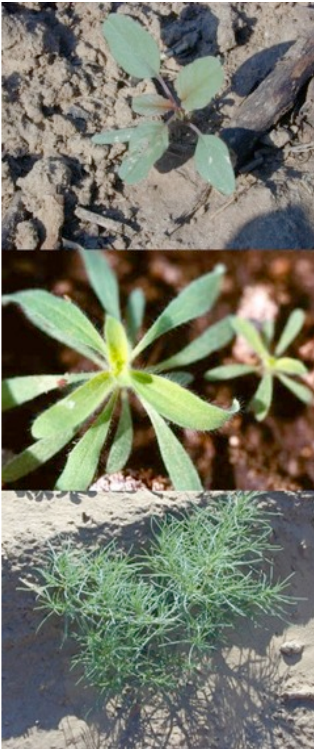
In addition to annual grasses, DNA herbicides effectively control Palmer amaranth (top), Kochia (middle) and Russian thistle (bottom)

The rate of each DNA herbicide is dependent on soil type. The sandier the soil, the lower the recommended rate. If soil conditions are dry and large clods are present during mechanical incorporation, herbicide performance