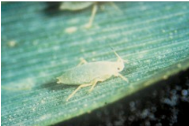
Russian wheat aphid