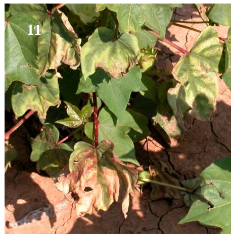
Leaf symptoms from fusarium wilt

results will be updated over the summer. The 2005 tests are being conducted at two sites, and results may be inconsistent between sites.