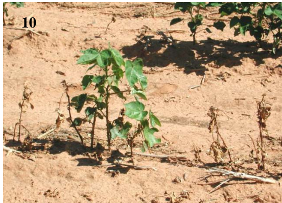
Stand loss from fusarium wilt

In some cases, consultants or producers are still confusing Fusarium wilt damage with herbicide injury. The leaf symptoms associated with Fusarium wilt are distinctly different than herbicide injury, and the two should not be confused. The Plains Cotton Improvement Association is supporting variety testing in fields with Fusarium wilt. The associated table provides the relative ranking of varieties tested in 2004, and also tests that are currently being conducted in 2005. The 2005 data is still continuing to change, so