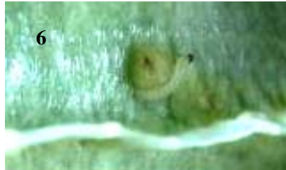
Wart and small larvae

To determine if a boll is infested you must break it open and look at the inside of the carpal or boll wall. Look for a tiny wart;