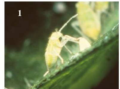
Fleahopper feeding on egg

Cotton fleahoppers have failed to be a significant problem this far. Older cotton is out of the woods with this pest but later cotton, cotton that is not flowering yet or high yielding fields that are still in early bloom are still vulnerable. Remember that fleahoppers attack the tiniest squares, pinhead- sized. These are associated with leaves that are still rolled up. Once your yield potential has been realized and this is represented in larger squares, blooms and bolls, stop fussing with this tiny pest.