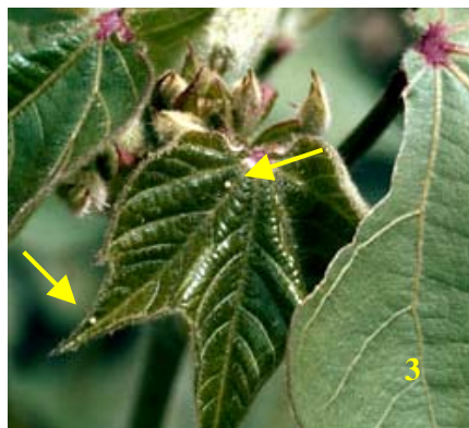
Eggs on terminal leaf

Coverage is still not a big problem at this time and so some of the pyrethroid alternatives such as Steward, Tracer, Denim, Lannate, Larvin and Curacron should be considered to avoid increasing aphid problems, spider mite problems, and perhaps beet armyworm problems. These materials will only give you fair control compared to standard control associated with pyrethroids but that level of control is probably good enough for this time of year when coverage is not as big a problem and infestation levels are lower.