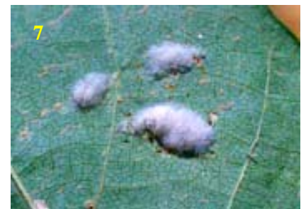
Beet armyworm egg mass

in the boll weevil eradication program. As long as our cotton fields remain relatively pesticide free, natural enemies and heat should keep our beet