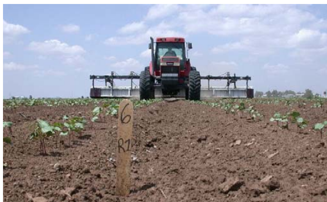
Post broadcast Roundup application irrigated Crosby Co. field, June 4

Once past the four-leaf stage, two post-directed or shielded sprayer applications can also be made, at a maximum 22 oz/acre/application.