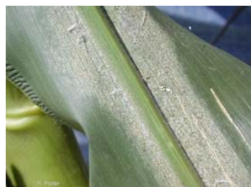
Mites on corn

It should be noted that growers north of I-40 are already spraying for mites. We have low numbers of Banks grass mites present in corn right now. The good news is that beneficial