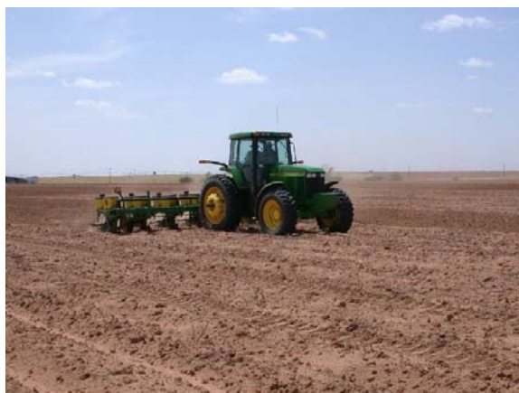
Dry planting at Lamesa, June 8

Dry conditions currently persist over most of the dryland area west and south of Lubbock. As the final cotton planting dates for insurance purposes arrive for these counties, we find many producers scrambling to get cotton seed