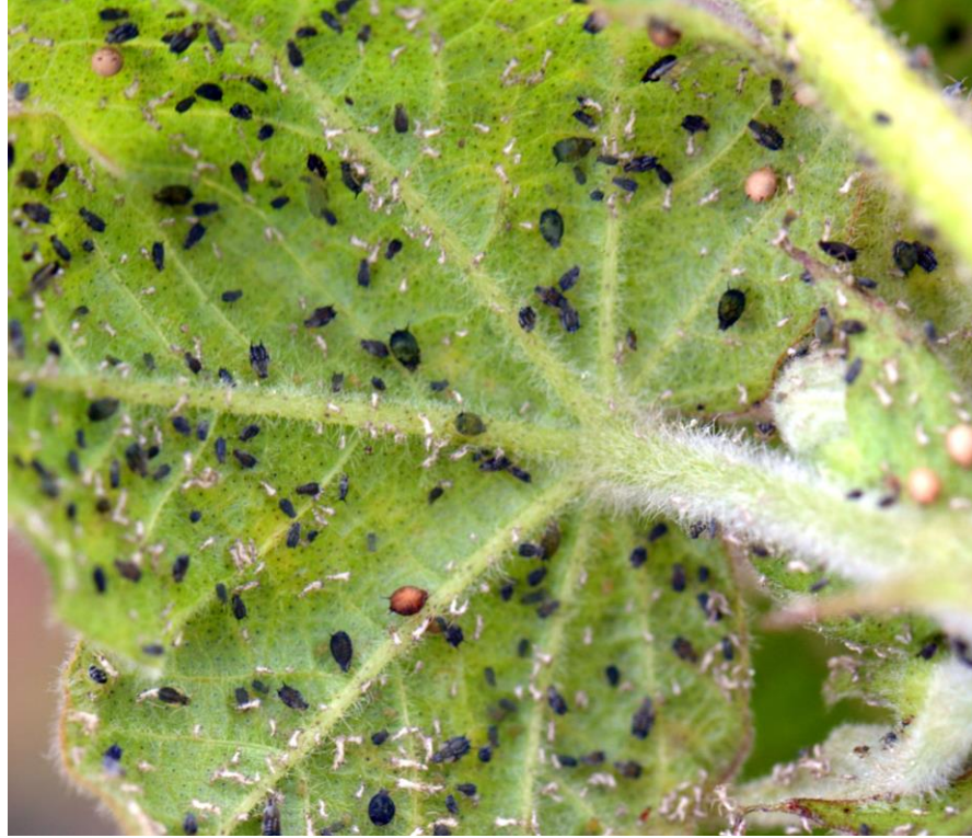
Figure 1. Cotton aphids on underside of a cotton leaf