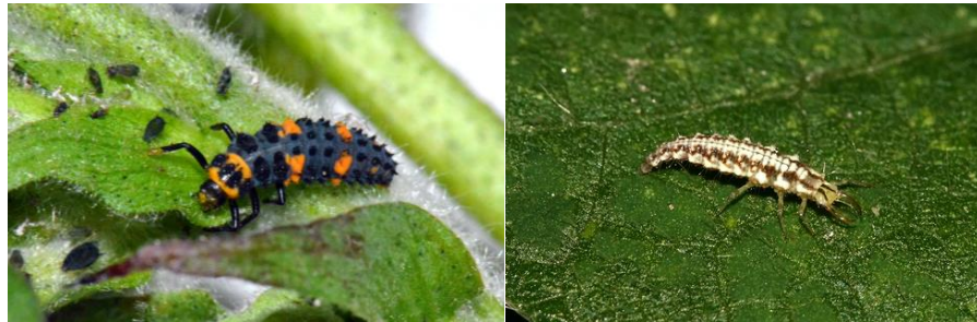
Figure 2. Two primary beneficial insects those feed on cotton aphids: lady beetle (left) and lacewing (right) larva