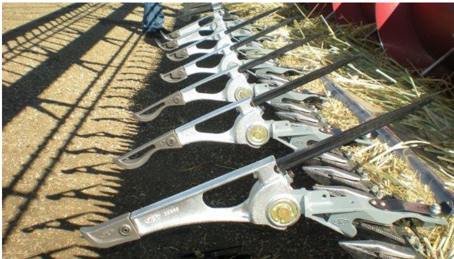
Fig. 5. FlexxiFinger model FlexxiFloat 250 with different shoes mounted on a cutter bar.

Here's what these look like mounted on the cutter bar (Fig. 6; this appears to be a different lifter Arm, probably the 250 model which is a little longer, and then there are four different shoes, or lower tips, mounted on the Arms in this demonstration photo). Two individuals have commented that the FlexxiFinger is doing a better job of lifting the downed sorghum than the John Deere fingers in Figs. 1 & 2. One grower in Lynn Co. who was running JD fingers on 11/26/2014 switched on 11/28 to FlexxiFinger, and has harvested a couple of fields. He noted that on uneven ground they were snagging the John Deere tips in the soil and bending them back under, and he has only snagged on FlexxiFinger, and said it was his own fault. I anticipate that FlexxiFingers probably cost more than John Deere, but I haven't priced any of the equipment.