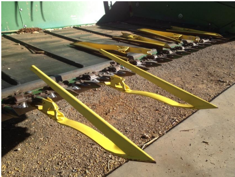
Fig. 1. Fingers, or lifters, that are available from most John Deere dealers for harvesting downed grain sorghum. Not all look exactly the same (or might be painted a different color).

Dealers have their own lifters, most are yellow like you see in Fig. 1. If John Deere dealers are sold out temporarily they should be able to have more in from Illinois in 2-3 days according to one dealer. The ones I have seen were stamped "Made in Germany."