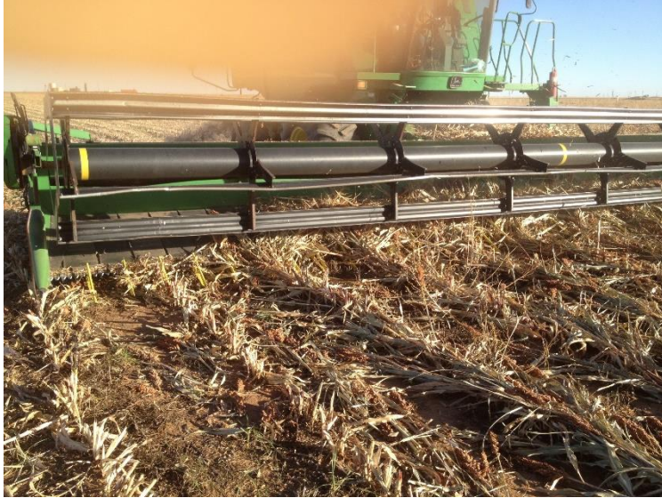
Fig. 2. Fingers from John Deere being used in downed grain sorghum, north of Levelland, Nov. 26, 2014. The farmer is harvesting all rows from east to west as the sorghum is mostly lying down to the east or southeast. This greatly improves the harvesting as driving west-to-east, much of the sorghum otherwise slips under the header. This particular reel has flat batts, which don't help much in bringing the downed grain sorghum onto the header. This combine is traveling about 3 mph in this field though some producers have reported driving as slow as 1.5 mph due to heavy moisture lower stalks that run the risk of plugging the header or the internal threshing mechanism.

Growers with John Deere headers (and likely Case IH, Massey, others) also note that they are having improved success by using a reel that instead of flat batts (like in Fig. 2) has fingers (teeth) on the reel batts, which act more like a rake, and help pull the downed sorghum, once lifted by the fingers, onto the platform. The tips of the fingers on a reel like this actually can extend just below the top side of the lifter to pull the sorghum stalks into the header (Fig. 3). According to John Deere dealer staff, these can be added to batt reels if needed (I believe replaces the batts).