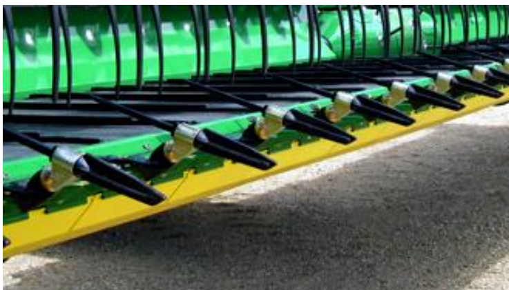
Fig. 3. Note the teeth from the reel batts just above this different version of FlexxiFinger cutter bar attachments. The reel can be lowered enough to rake into the downed sorghum and pulled onto the header, reducing some grain losses at the cutter bar.

Growers with John Deere headers (and likely Case IH, Massey, others) also note that they are having improved success by using a reel that instead of flat batts (like in Fig. 2) has fingers (teeth) on the reel batts, which act more like a rake, and help pull the downed sorghum, once lifted by the fingers, onto the platform. The tips of the fingers on a reel like this actually can extend just below the top side of the lifter to pull the sorghum stalks into the header (Fig. 3). According to John Deere dealer staff, these can be added to batt reels if needed (I believe replaces the batts).